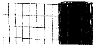
2" x 4" Welded Wire